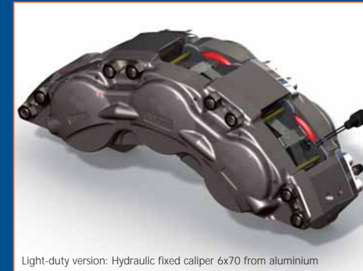
Light-duty version: Hydraulic fixed caliper 6x70 from aluminium