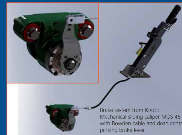
Brake system from Knott: Mechanical sliding caliper MGS 45 with Bowden cable and dead centre parking brake lever