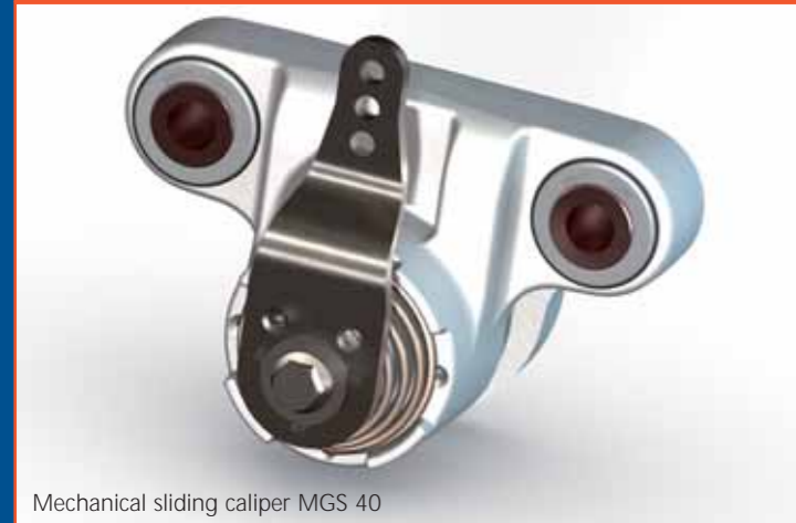
Mechanical sliding caliper MGS 40