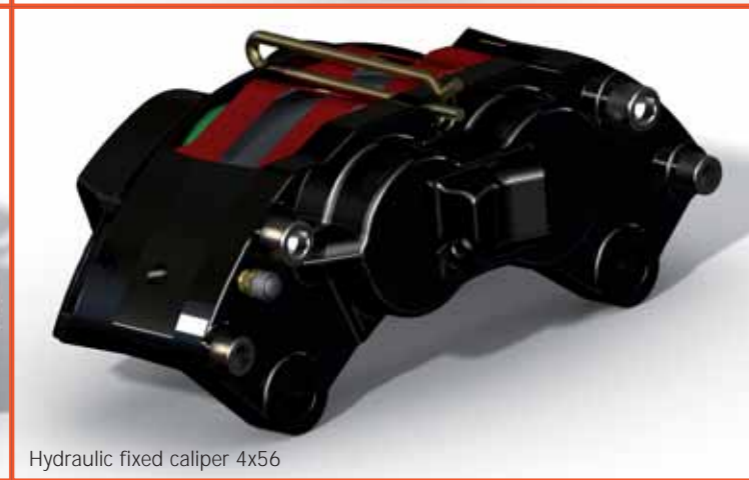
Hydraulic fixed caliper 4x56