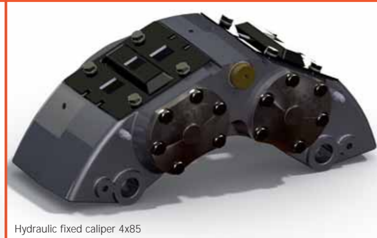
Hydraulic fixed caliper 4x85

What distinguishes Knott brakes is their perfect adaptation to the vehicle, resulting in • high loading capacity • consistent performance • high braking effect and comfort • a long service life • exemplary ease of maintenance