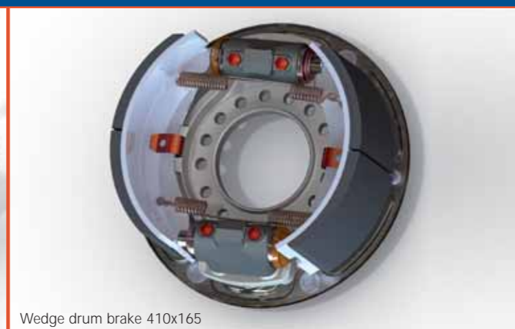
Wedge drum brake 410x165