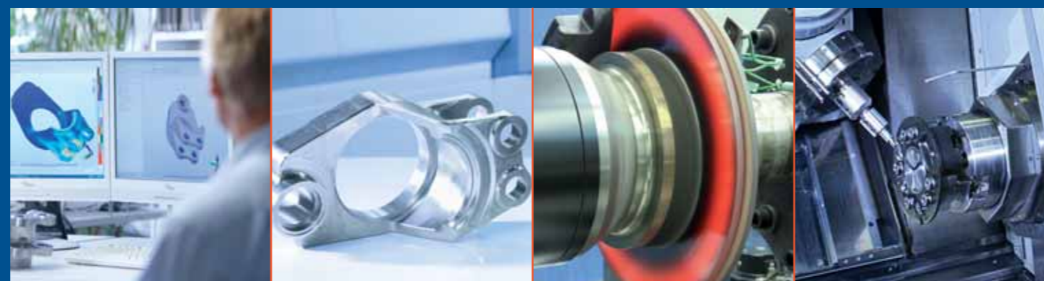
Knott monitors every step along the way: in-house design, in-house prototype construction, in-house testing and production.