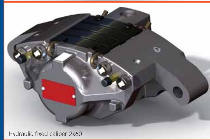
Hydraulic fixed caliper 2x60