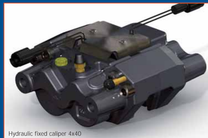
Hydraulic fixed caliper 4x40

Knott has good reason to claim the title of specialist in brakes and braking systems for defence applications. With braking systems and variants to cover the every conceivable requirement, Knott supplies bespoke solutions from its own development and production. Your mission, the conditions you will be facing, and the area of application of your vehicle are the deciding factors when it comes to determining the operating principle, design and performance of your brake or braking system.